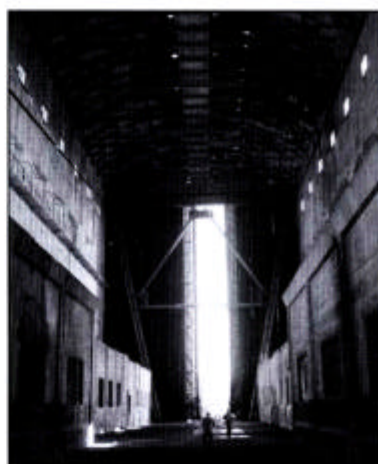
View from inside

The huge entrance doors are already very impressive, but the interior is even more so. It is as long and high as the central nave of the gothic cathedral of Cologne, but twice as wide.