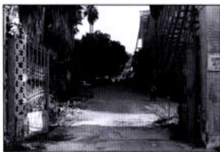
View from the entrance gate

In the following decades it was used for storage and workshops for a hydroplane base, which operated from the natural Megarese port nearby and later for a helicopter base. But since many years there is no use anymore for this impressive building and technical decline left its highly visible marks. The enormous weight of the more than 30 meter high doors hanging at a beam right under the roof gave tensions into the structure which it could not withstand. A huge steel structure was brought in, which should stop this movement, together with steel cables linking it to the ground. But still new cracks appear in the concrete structure.