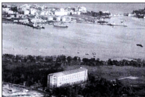
View from the air

On December 24th 1987 by the ordinance nr.2739 Sicily Region Government declared it a highly interesting historical monument. It was last mentioned in London on April 25th 1989 at the Exhibition "Housing the Airship" about Airship/balloons time and their hangars. Completely abandoned since then it has been damaged by frequent hooligan actions."