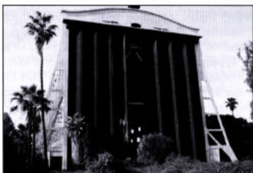
View from the front

Visiting this place today is an absolutely outstanding experience, not only for airship enthusiasts. The whole site is full of palm trees and nature has gradually taken possession of the declining military buildings. Higher than any palm tree, the hangar dominates the site visible from far away. It has something of Inca temple ruins in the jungle.